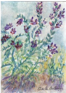
Braunton's Milk-Vetch Astragalus brauntonii