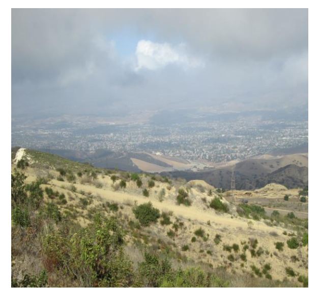
View from SSFL with KB Homes grading in Runkle Canyon-Simi Valley

Elected officials and environmentalists concerned with wildlife such as mountain lions and bobcats are working together to build the Liberty Canyon Wildlife Crossing for connectivity between the Simi Hills south to the Santa Monica Mountains. Some cleanup extremists are advocating that a road be built on the west side of the SSFL through the Simi Hills connecting to the new KB Homes development to carry the 100,000+ truckloads of soil-rocksstructures that they demand be removed from the SSFL site. This is an irresponsible idea that will further destroy the sensitive wildlife corridor in the Simi Hills. A road built between the SSFL and KB Homes development cutting through the Simi Hills would contradict the purpose of the Liberty Canyon Wildlife Crossing.