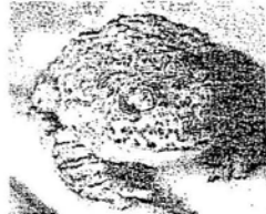
Southwestern arroyo toad

Although the owner of the land where 4,300 houses are proposed to be built along the Santa Clara River and its tributary San Francisquito Creek, said the Southwestern Arroyo Toad didn't exist on the land, a biologist hired by the Friends of the Santa Clara River found 4 on the property in April. The discovery of the toads heightens concerns about habitat protection. As a result, the Army Corps of Engineers will review a permit it had issued to the Newhall Land & Farming Co. for erosion control construction in about 10 miles of river channel. The U.S. Fish & Wildlife Service and Army Corps of Engineers officials will hold a meeting at the river to discuss the discovery on Newhall Land's permit to alter the riverbed.